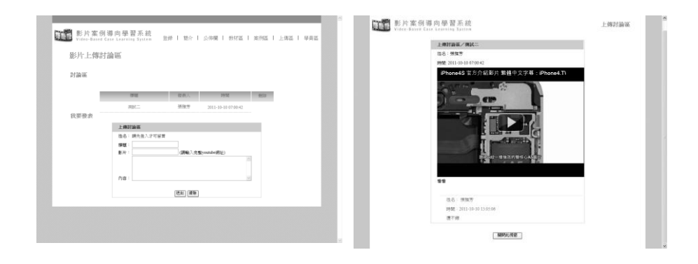
Fig. 8. The upload discussion page